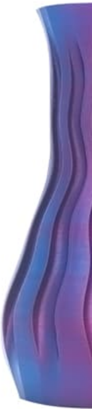
● Silk PLA Rainbow