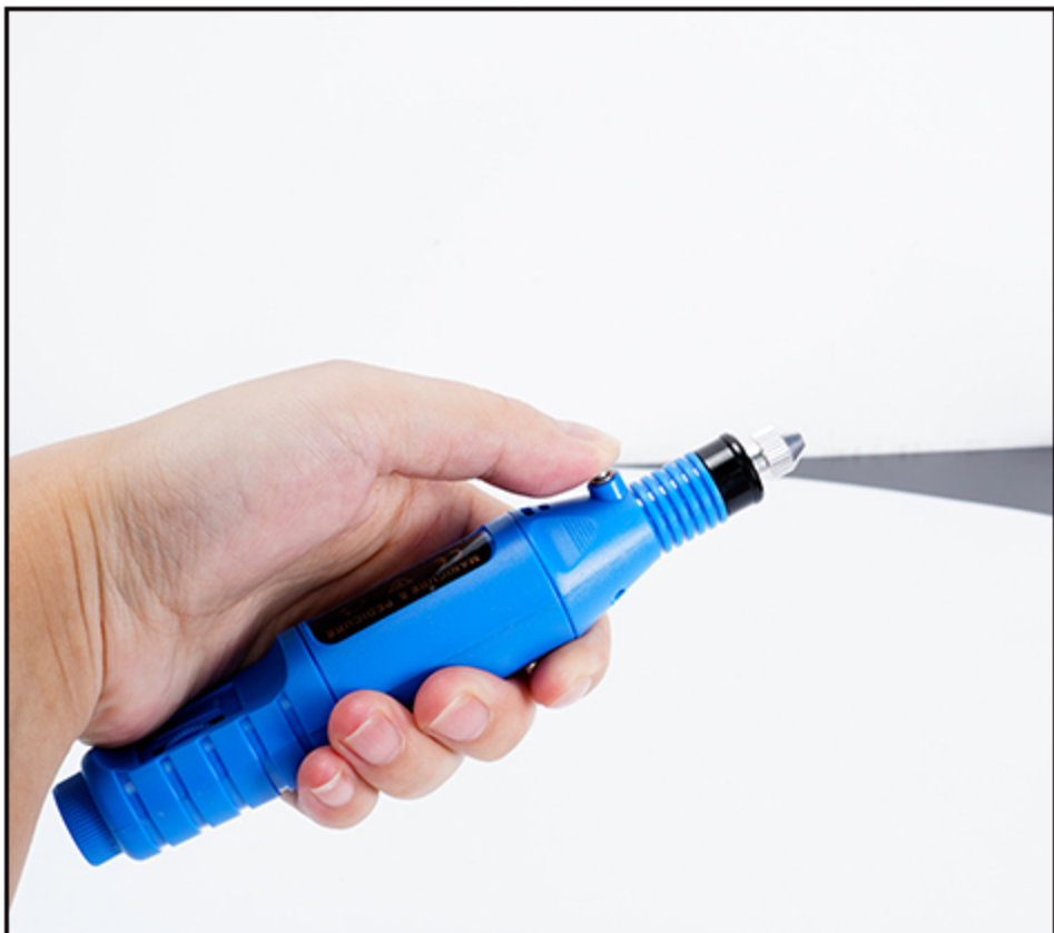
Step1:Press the positioning switch