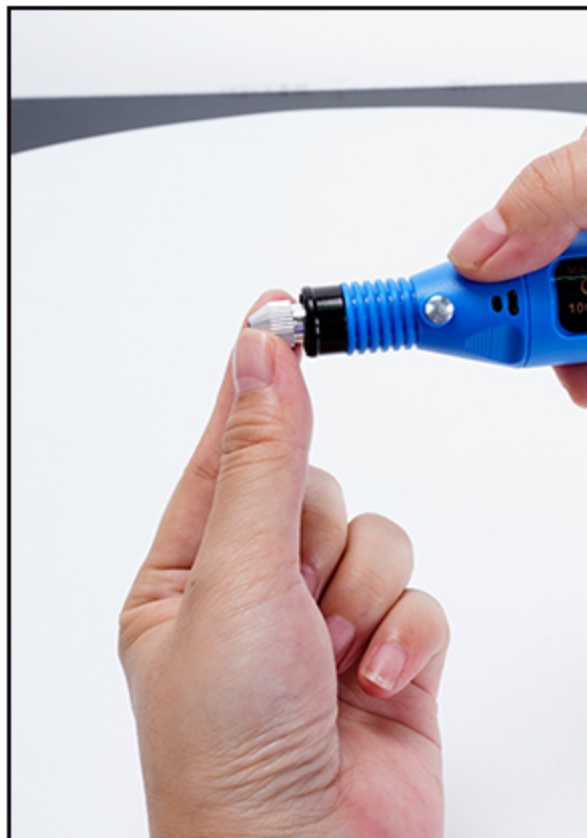
Step2:Loosen the retaining ring