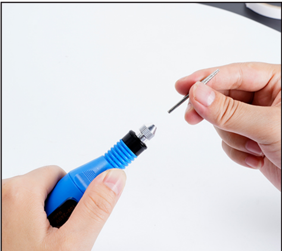
Step3:Insert the grinding head