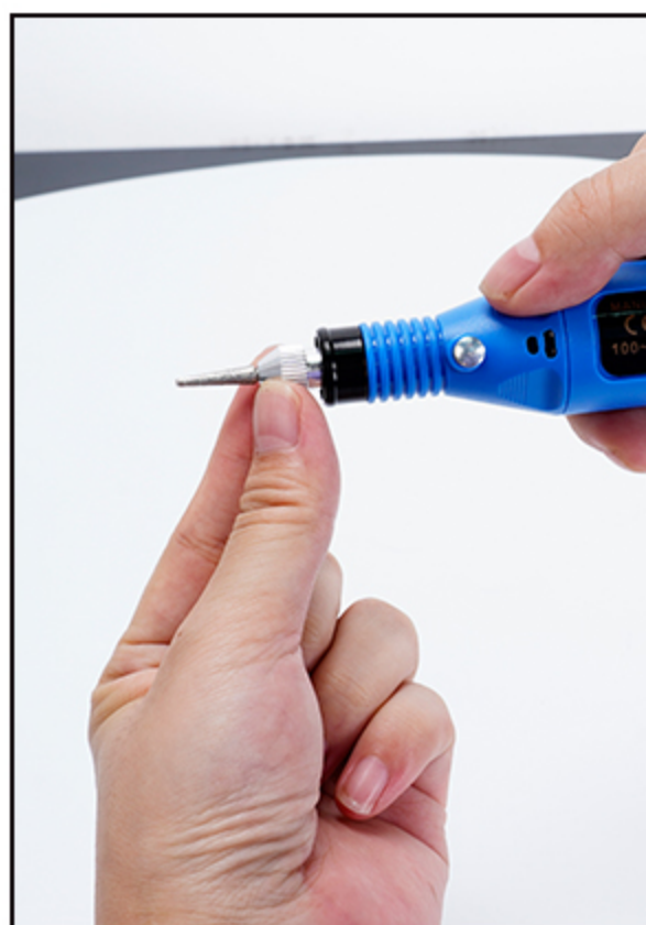
Step4:Tighten the retaining ring