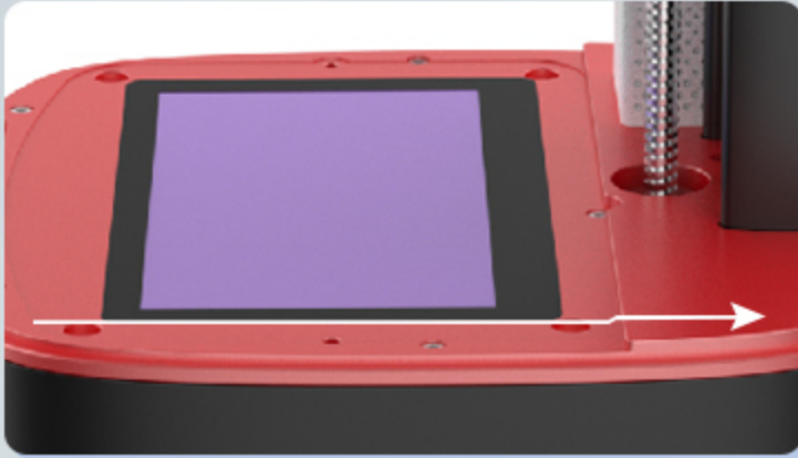
Prevent Resin Leakage from Damaging the Machine